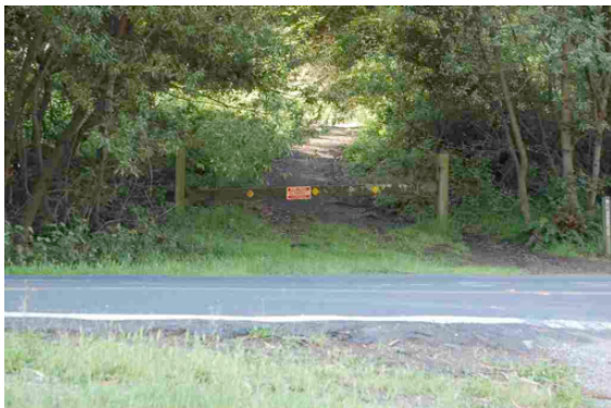
Coming from #10A, almost to #11

Unless rain dictates otherwise, do not take any of the 5 roads. Cross the intersection carefully and courteously, and continue on the Selby Trail down to 11-[Brazil Bldg Parking Lot] .