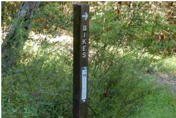
The “bikes” signpost