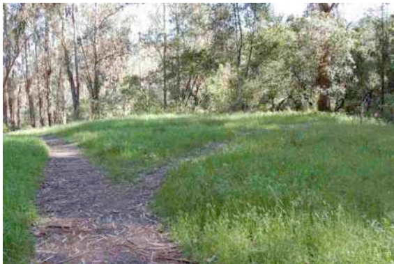
Veer right here

At this 2nd signpost (above), turn left and a short down to somewhat of a flat (with Lake Anza in sight through the trees]