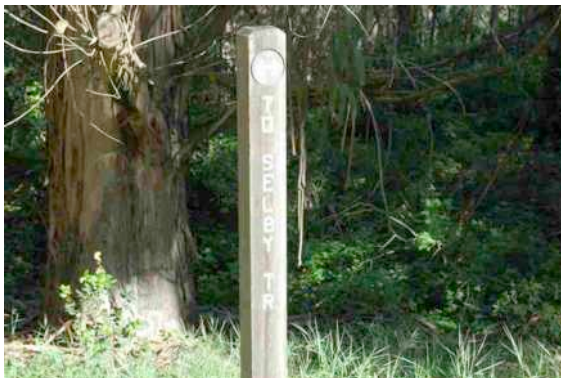
The first signpost nearing #11

Checkpoint #11 is not where you think it is. After you again cross Wildcat Canyon Road, carefully and courteously, there are bathrooms nearby, up & off to your right. Use them. Otherwise, the hike continues east (straight) on the street-looking parking lot. On your left, the first sign-post says Selby Trail (both ways). Ignore this post. About a half block back on the parking lot /road, across from the start of the grassy area behind the Brazil Building is a 2nd sign-post. It says Wildcat Canyon Rd / Selby Trail. This is checkpoint #11. (Although we'll probably be at the first sign-post just to clear up any possible confusion). Also this may or may not also be a car access dropout point (15.5 mi). We hope it will be. We'll have to see.