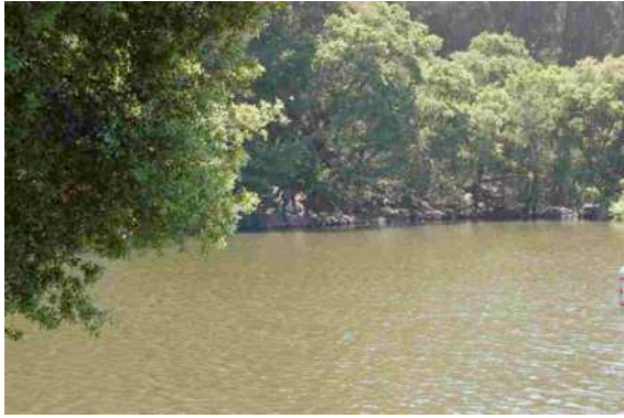
East side of Anza looking back from the earthen dam

When you reach the earthen dam at the northeast corner of Lake Anza, you'll see a trail straight ahead and leading down. Please don't take this unmarked shortcut. Please turn left across the earthen dam. Just before you cross Anza's concrete spillway, there is another sign-post on your right that directs you down and north continuing towards #12 on Wildcat Gorge Trail.