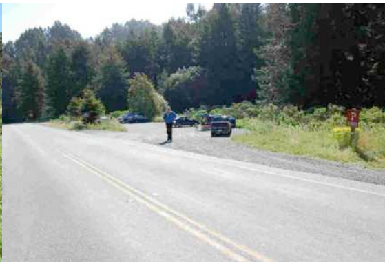
#10 road crossing