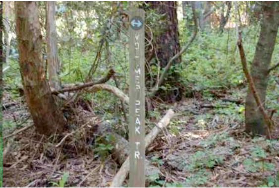
Don't go straight on Vollmer Pk. Trail