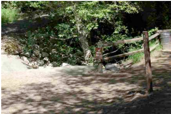
Not quite to #11b yet

Continuing on the Wildcat Gorge Trail again, you'll pass a creek crossing on your left