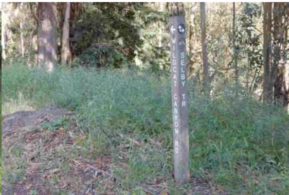
Not this 3 rd post off to the left