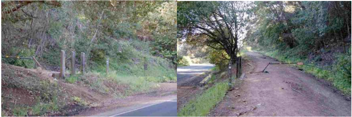
After # 7 (Inspiration point)

and head up, across, and down on the Sea View Trail towards 8-[Top of Big Spring Tr.] .