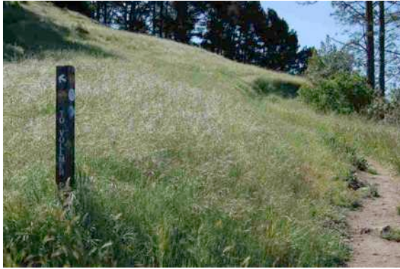
2 nd post again – veering right