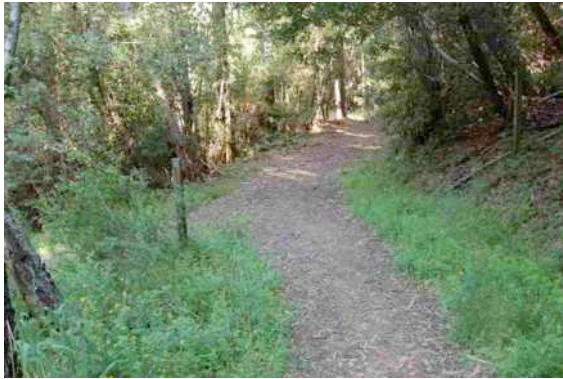
Turn left at the “Bikes” signpost

[Pay attention here! Look for the OA red-arrow signage between #8a and the “Bikes” signpost getting you to #9 Lunch site. (Note above & below photos.) Make a left at the signpost that says “Bikes”. Absolutely do not continue north (straight) on the Vollmer Peak Trail -- you are only 200’ from the lunch site !!! Make a quick right crossing the road to the lunch site. And please cross South Park Drive carefully and courteously , no matter how hungry or tired you might be !