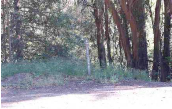
The second signpost, a closer look

At this 2nd signpost (above), turn left and a short down to somewhat of a flat (with Lake Anza in sight through the trees]