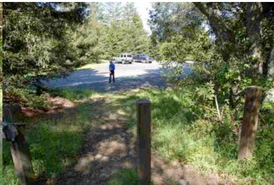
Across the road from # 9 - lunch site

At #9 , this is also your 2nd water refill stop. But bathrooms are not quite nearby enough... sorry about that.