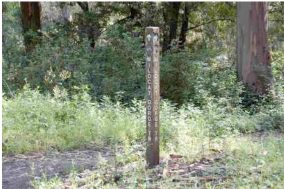
The 3 rd signpost to Wildcat Gorge trail

You should find a 3rd sign-post off to your right that says Wildcat Gorge Trail. After a switchback up, down, and across Wildcat Creek, you'll be at canyon's bottom again heading north towards 12-[Bottom of Meadows Canyon Trail] right along the east side of the creek. There are a couple of off-shoot trails here but stay by the creek as best you can. When you get to the bridge crossing at the south-east tip of Lake Anza ( #11A on the map) please do not turn left across the bridge. Please stay on the east side of the lake. And stay right by the lake. Off-shoot trails again ... and it's rocky going in a couple of spots but it's relatively short.