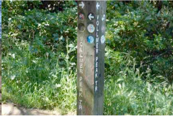
at 3 rd post – Turn right & down

[Pay attention here! Look for the OA red-arrow signage between #8a and the “Bikes” signpost getting you to #9 Lunch site. (Note above & below photos.) Make a left at the signpost that says “Bikes”. Absolutely do not continue north (straight) on the Vollmer Peak Trail -- you are only 200’ from the lunch site !!! Make a quick right crossing the road to the lunch site. And please cross South Park Drive carefully and courteously , no matter how hungry or tired you might be !