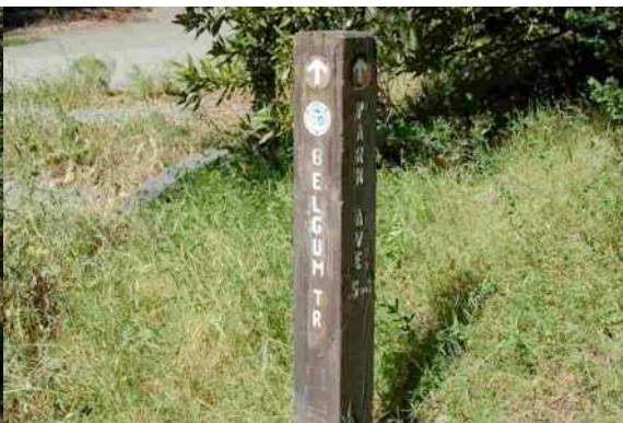
# 3 – Belgum Trail signpost zoomed in

Somewhere around #3a , you might spot palm trees and building foundations and traces thereof, off to your right. This was originally the site of an 1800's hacienda. Later on in 1914, it also served some other purpose.